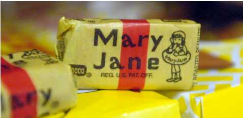
A variety of candy at Sweet Street in Lombard includes the old fashioned Mary Jane.

"They have a good variety of candy here," she says, looking over the shelves. "The candy tastes good, and it's fresh."